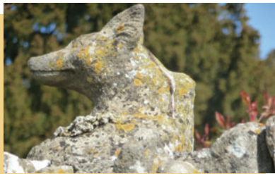
A fox and a dovecote