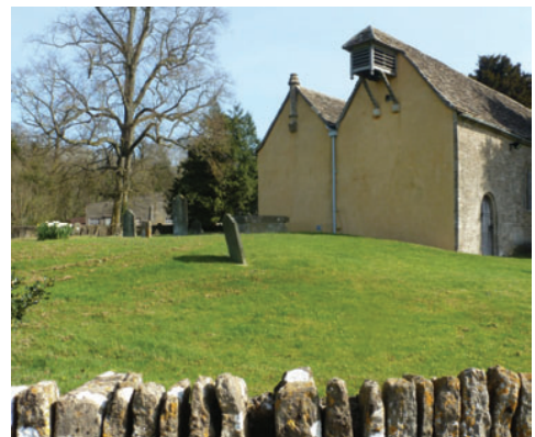
St Michael's and All Angels' church is over 700 years old. To see inside it please call the churchwarden on 01454 218407.