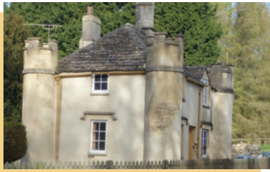
Two very small castles