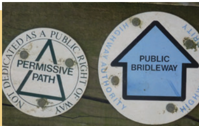
Follow these signs